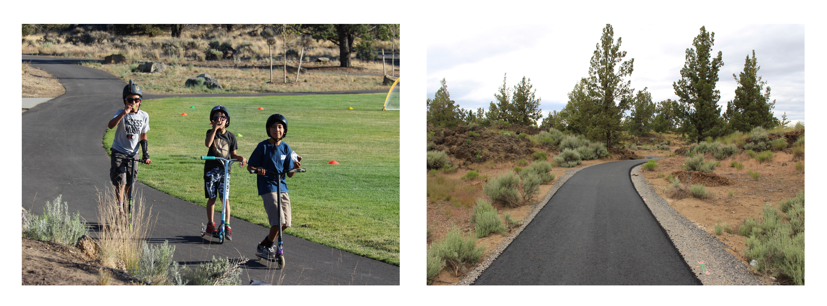
Paved Perimeter Path