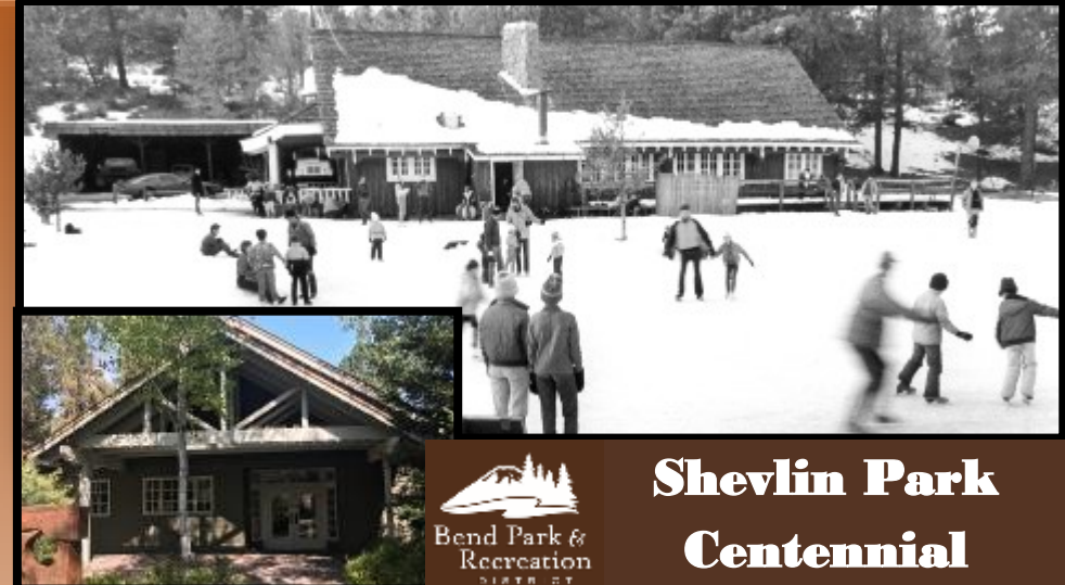
Above: Skaters at the old Hatchery building; Inset: Present day Aspen Hall

This is where you go to get away from it all. To walk, run and bike. To picnic, read and reflect. To watch birds and deer and lizards and ponderous trees and a quicksilver creek. To listen to the wind, the creek, the voice of your friend, your partner, yourself. To teach your kids to fish, skip stones and explore the wilds, carefree and completely unplugged.