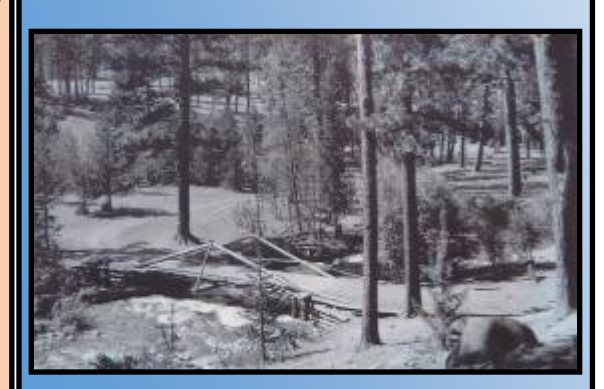
Tumalo Creek bridge at Shevlin Park, photo courtesy of the Bowman Museum

Shevlin-Hixon sold to Brooks-Scanlon in 1950. The foresight of those who created Shevlin Park—local community members, Shevlin-Hixon management, the U. S. Forest Service and the Bend city council—is remarkable and the gift by Shevlin-Hixon is timeless. In 1919 most of the surrounding timberland was still virgin forests of old growth Ponderosa Pine. From a layperson's viewpoint it probably seemed it would last forever. It didn't, but with proper management Shevlin Park will, to the benefit and enjoyment of the public in perpetuity.