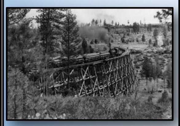
Railroad trestle over Shevlin Park

In 1941 Brooks-Scanlon, as an assignee of Shevlin-Hixon, used the third condition to build a railroad trestle through the park to reach their vast timber holdings to the north and west of Tumalo Creek.